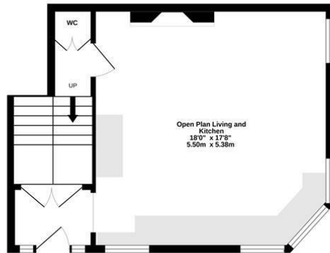
GROUND FLOOR 397 sq.ft. (36.9 sq.m.) approx.