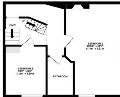
1ST FLOOR 440 sq.ft. (40.9 sq.m.) approx.